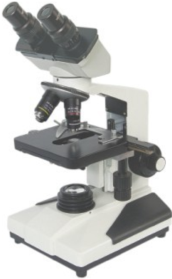
MODEL- KXL-2001 (LED)