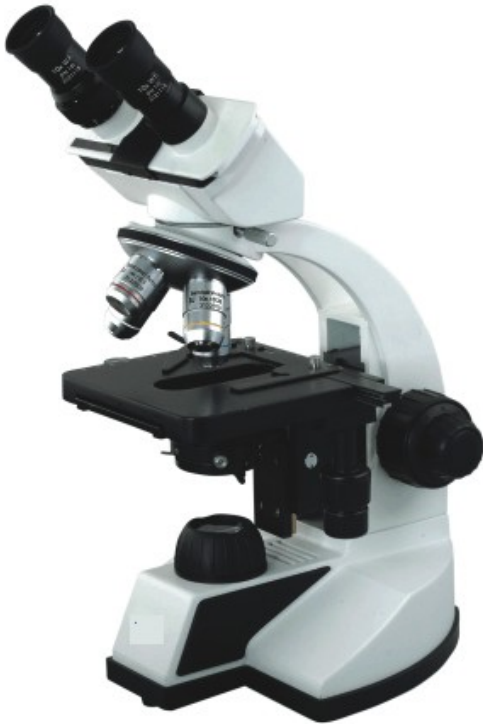
KWALITY LED (CORDLESS) MICROSCOPE