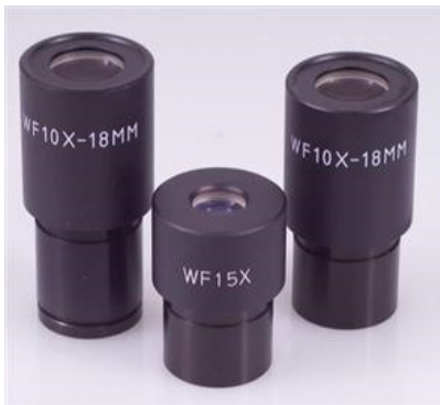
WF-10X (EYE PIECE)