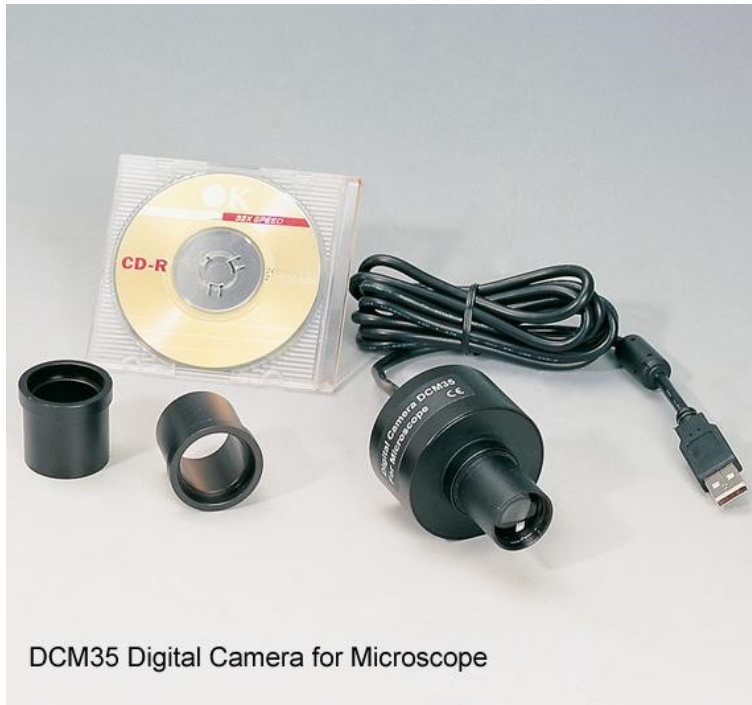
DCM35 Digital Camera for Microscope