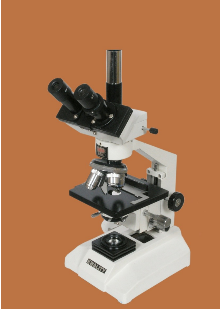
Model- KLM-105 T