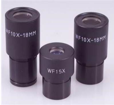
Micrometer Eyepiece-10X (EYE PIECE)